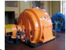
Hydroelectric Power Station